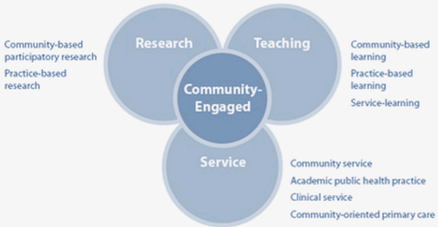
Figure 1 | Community-Engaged Teaching, Research, and Service