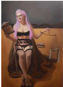
Painting by Neda DeCa

Invited Presentation , “Violence and Vulnerability,” the Norwegian Centre for Violence and Traumatic Stress Studies (NKVTS) and the Gender Violence Coalition of Oslo, Norway, June 2017.